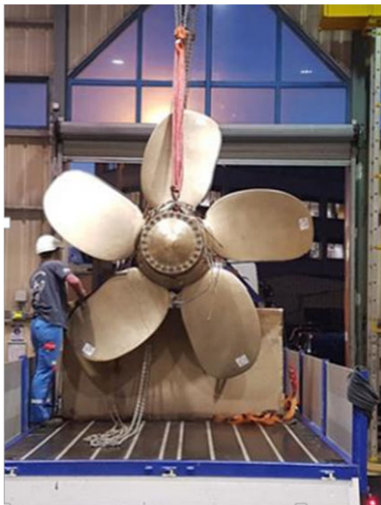
Fig. 2. 3D-printed screw of the new generation

The maritime industry is now looking to deploy more and more new generation vessels that could become a major component of the global freight transportation of the future. Since the 1960s, vessel tonnage has steadily increased due to economies of scale and fuel efficiency, with some container ships now boasting a capacity of 24,000 TEU. In port, these giant vessels are systematically connected to the shore power grid, reducing emissions